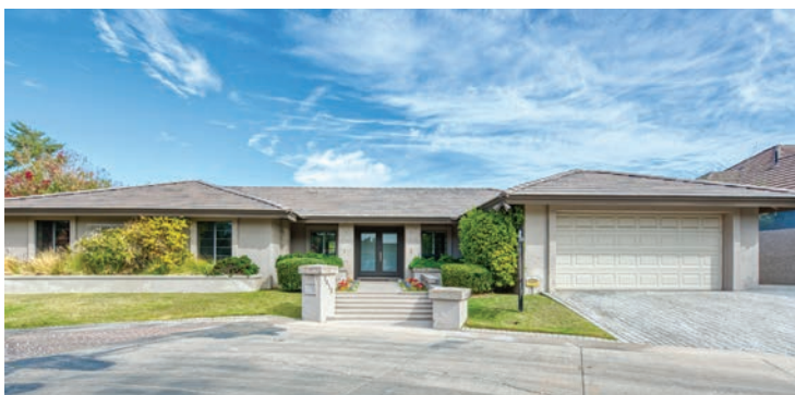
2412 E Montebello Ave, Phoenix, AZ 85016 3 Bed | 2.5 Bath | 3,270 Sq Ft | Taliverde