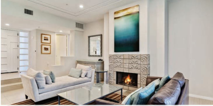
2802 E Camino Acequia Dr 51, Phoenix, AZ 85016 2 Bed | 2 Bath | 1,415 Sq Ft | Hotel Villas