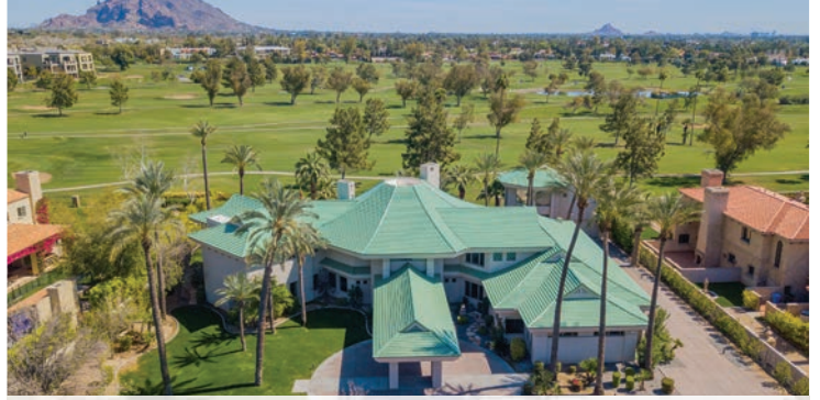
42 E Biltmore Est, Phoenix, AZ 85016 6 Bed | 7 Bath | 11,697 Sq Ft | Biltmore Circle