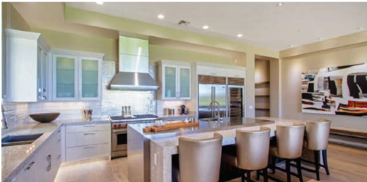
2 E Biltmore Est 101, Phoenix, AZ 85016 4 Bed | 4.5 Bath | Two Biltmore Estates